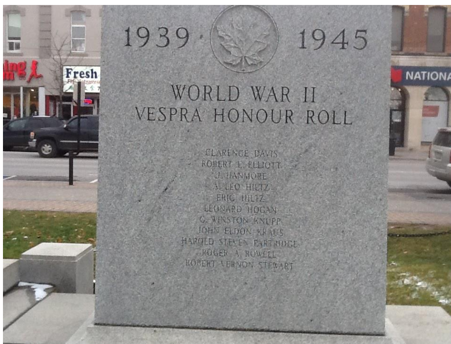
His name is listed on the cenotaph in Vespra near Barrie, Ontario.