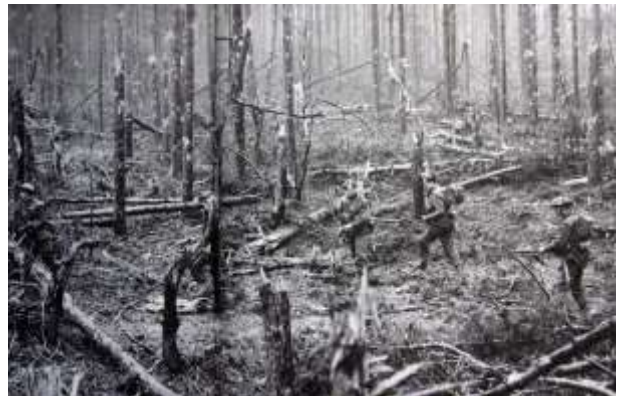
Moyland Wood, Germany February 1945