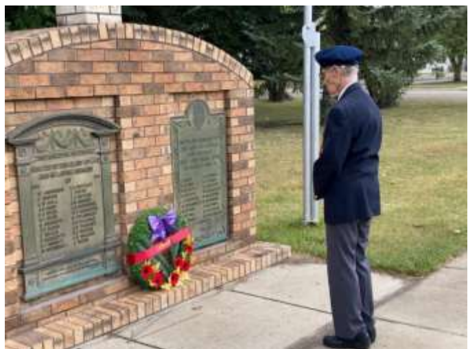
Carlyle, Saskatchewan Cenotaph

McKay Lake, Saskatchewan was named after him as a geo-memorial site.