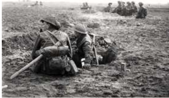
Personnel of the Regina Rifles preparing to attack enemy in Moyland Wood near Calcar, Germany, 16 February 1945.