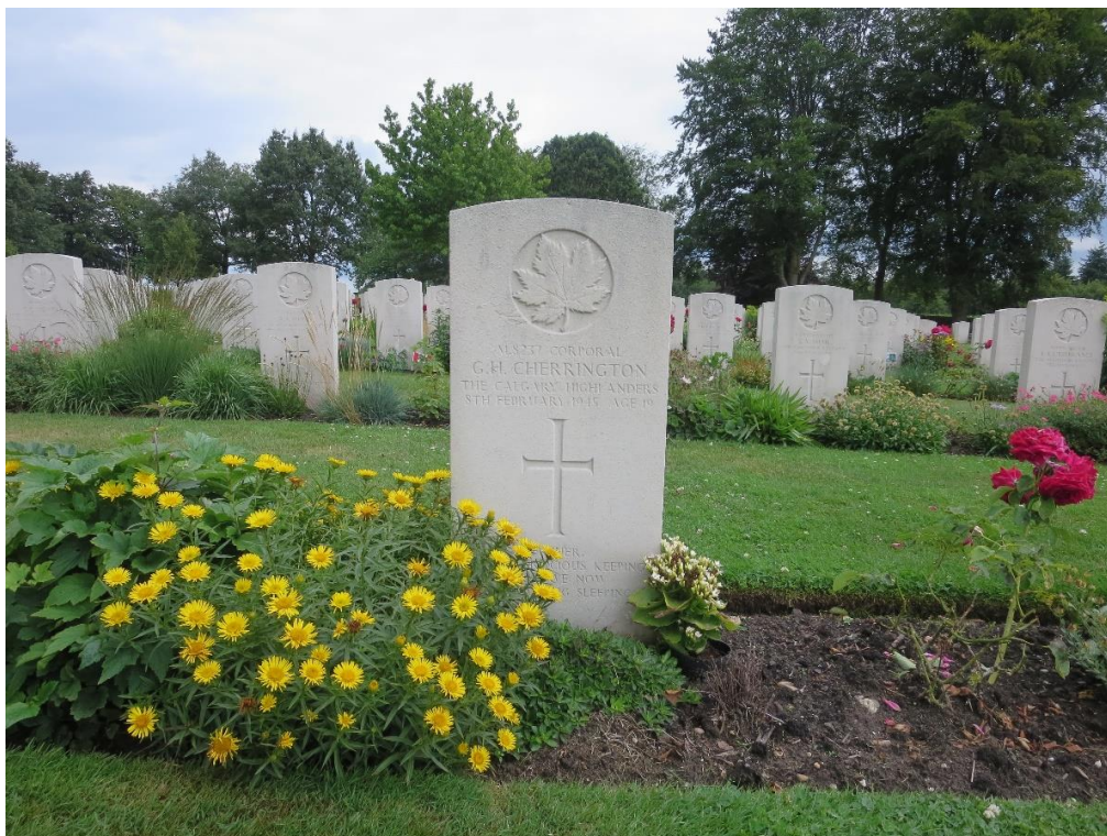
13 July 2019 – photo Alice van Bekkum.