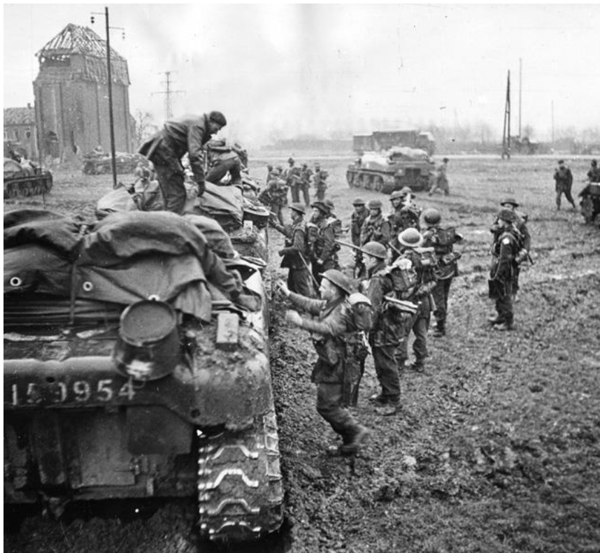
Winnipeg Rifles troops mounted Kanagaros.

According to military records, the Winnipeg Rifles troops had debussed from well-armoured Kangaroo carriers which had carried them through heavy artillery shelling and rocket fire. Castonguay likely died as the infantry charged on foot to overtake enemy positions in the fortified village of Louisendorf, Germany.