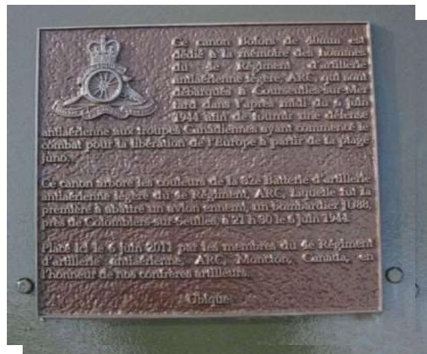
Plaquette in Courseulles-sur-Mer, Normandië, in honour of 4 LAA Regt. dd June 6 2001.

The 4 th Light Anti-Aircraft Regiment of the Royal Artillery was set up in 1938 for Canada's field and coastal defence, including anti-tank control. Later various regiments were merged. In April 1943, 4 LAA was part of the 21 Army Group, which was being trained for Operation Overlord (the Battle of Normandy).