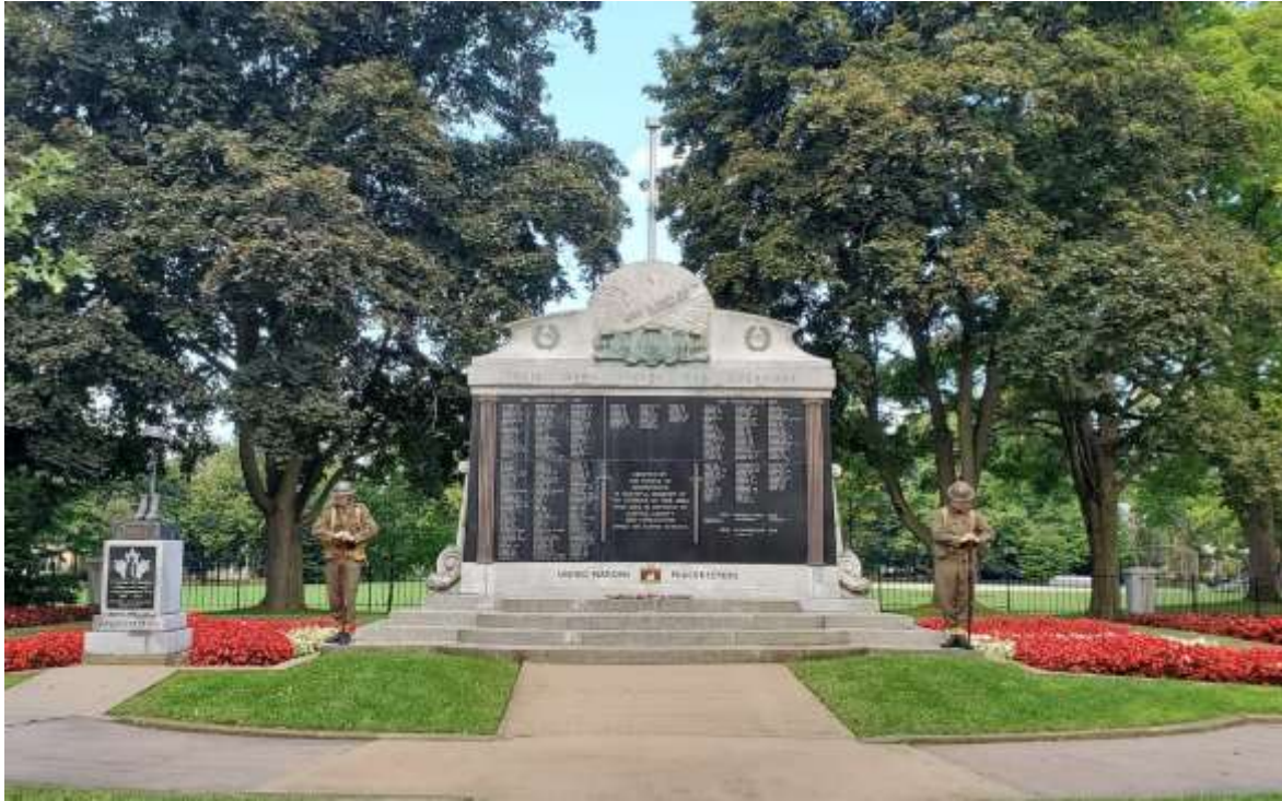
Cenotaph in Woodstock: marklivesinwoodstock.blockspot.com