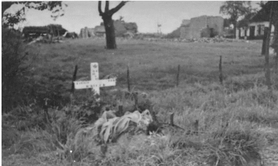
Field grave of a comrade...