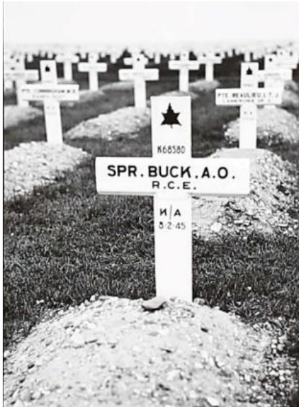
The grave as it was in those first days; in 1954 the crosses were replaced by headstones. The family could add a personal message.

Arthur was later given his permanent burial in the Groesbeek Canadian War Cemetery, grave reference II. D. 12.