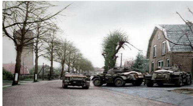
Canadian troops at the Terborgseweg, 1 April 1945

On Easter Sunday, 1 April the Canadian troops reached Doetinchem via the Terborgseweg. Members of the resistance were waiting for them on the eastern side of the town. After a short discussion, they continued towards the centre while at the same time other troops surrounded the town. There was heavy fighting going on in and around the centre. The