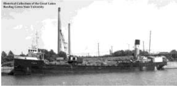
Lannan Coal Company Dock, Port Colborne, ON