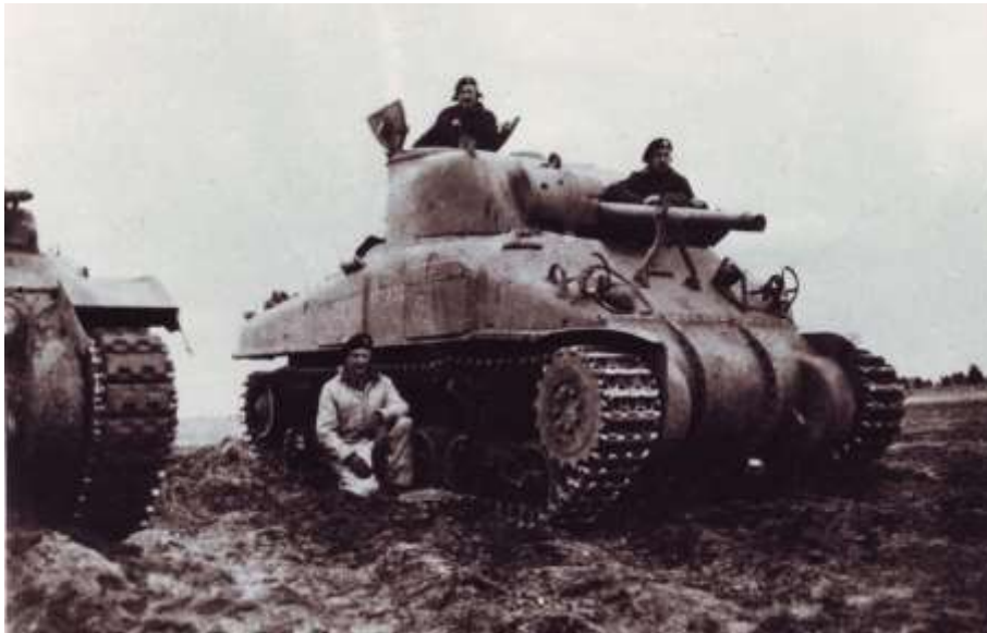
Lloyd kneeling in white, photo possibly taken training in UK

1 st Canadian Army had converted 72 Priest tanks to Infantry Carriers in August 1944, which became known as Kangaroos. They were effective in reducing infantry casualties during