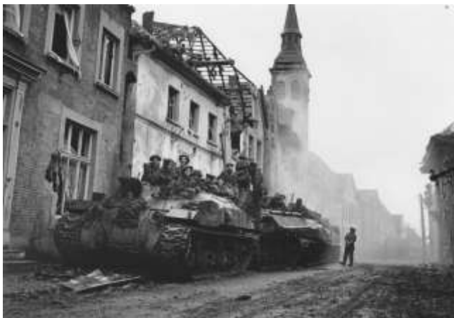
Scottish Div. on Kangaroos, Kranenburg, Germany

The Allied offensive Operation VERITABLE was launched 8 February 1945. Orders were received for "A" Squadron to go into action carrying Scottish soldiers and the convoy moved out at 21:45 hours that night.