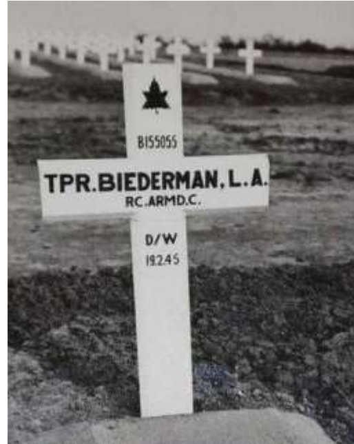
Lloyd Biederman's temporary grave marker before permanent headstone placement at Groesbeek, Netherlands