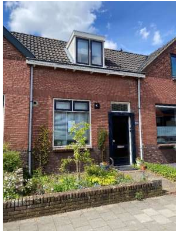
Treffers family former home at St. Jacobslaan, Nijmegen, NL