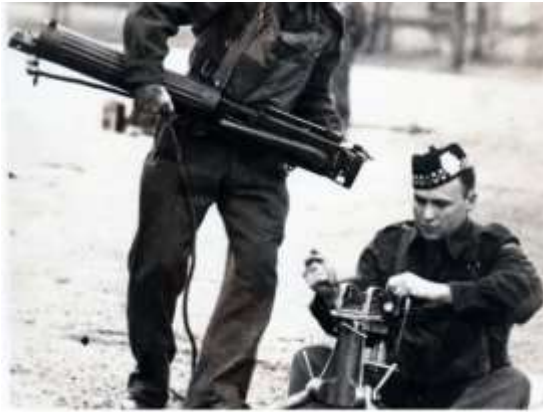
A machine gun crew of the Toronto Scottish setting a Vickers Medium Machine Gun for firing.

The TSR and 2 nd Canadian Division moved out as part of 1 st Canadian Army under Operation VERITABLE February 1945. They advanced into Germany where two battalions from 4 th Brigade were ordered to attack a section of the Goch-Calcar Road 18 February 1945. The Royal Hamilton Light Infantry and The Essex Scottish were supported by the Toronto Scottish Machine Gun and Mortar