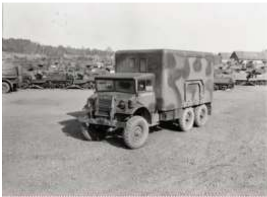
Canadian Military Pattern truck in version used for mechanical repairs. Chevrolet Model C60X, 3-ton, 6 wheel lorry. Canadian designed and built in Oshawa, Ontario. England, 19 March 1944.