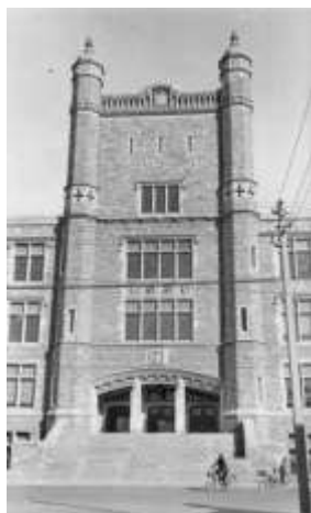
Toronto Central Technical School