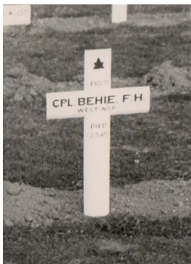
Grave like it was in the beginning.

He was temporarily buried in Nijkerk and was finally laid to rest on the Groesbeek Canadian War Cemetery, on 2 October 1945, grave reference XIV. E. 11.