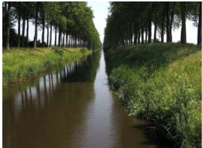
A current photo of the Leopold Canal

Private Arnold Allen was officially reported missing in action on September 14, 1944.