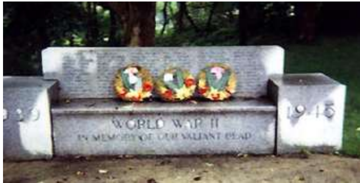
Shelburne Second World War Memorial Bench