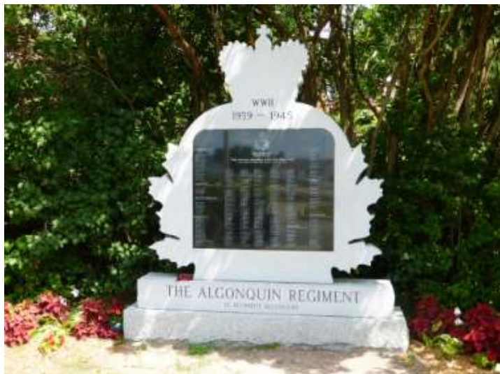
The Algonquin Regiment Memorial in Parry Sound, Ontario