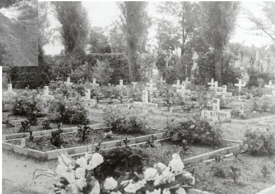
Orthen cemetery, later called Groenendaal